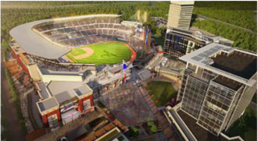
SunTrust Park, New Home of the Atlanta Braves

For our show theme of 2017, the Southeastern Stamp Expo celebrates the new home of the Atlanta Braves, and in the process, takes a look at the sport of baseball on postage stamps.